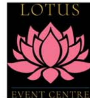
Lotus Event Centre