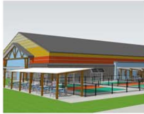
The Pickle Lodge